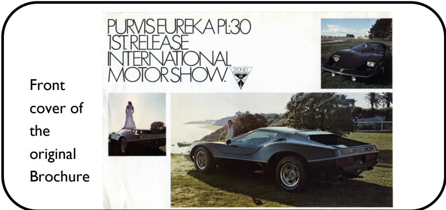
Front cover of the original Brochure