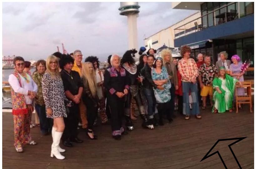
RETRO Pic of the Gang at the 70's themed Celebration Dinner Inside the Motorclassica